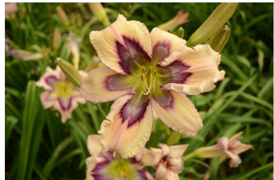
Phil Fass seedling

Be sure to check out the complete list of winners on the website.